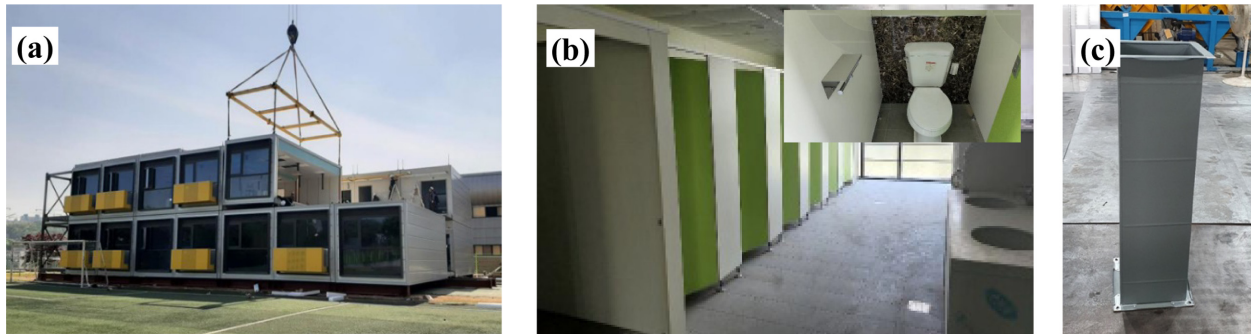
Fig. 2. Application of (a) interior panels for modular school and (b) toilet, and (c) duct panel for air conditioning system

good results were obtained with a growth rate of 0%. Table 2 summarizes the anti-viral and anti-microbial evaluation results.